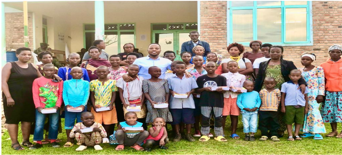
These are pictures taken during the event of giving help to those children.