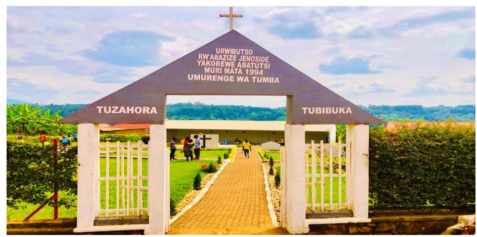
Activity 7: Community work (umuganda) at Genocide memorial site of Cyarwa in Huye district.

On 18<sup>th</sup> June 2022, HELPING HEART FAMILY RWANDA prepared a community work on the genocide memorial site of Tumba sector located in Cyarwa cell. Which started with a minute to remember the victims of genocide against tutsi in 1994. A genocide survivor in cyarwa cell (where that memorial site is located) shared her testimony about what happened during the genocide and how people in Cyarwa cell overcame the problems caused by the genocide. The community work was aiming at cleaning the genocide memorial site by cutting down the bushes, mopping and sweeping the compound and the graves.