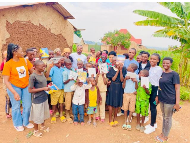
Children who were Street children receiving school materials