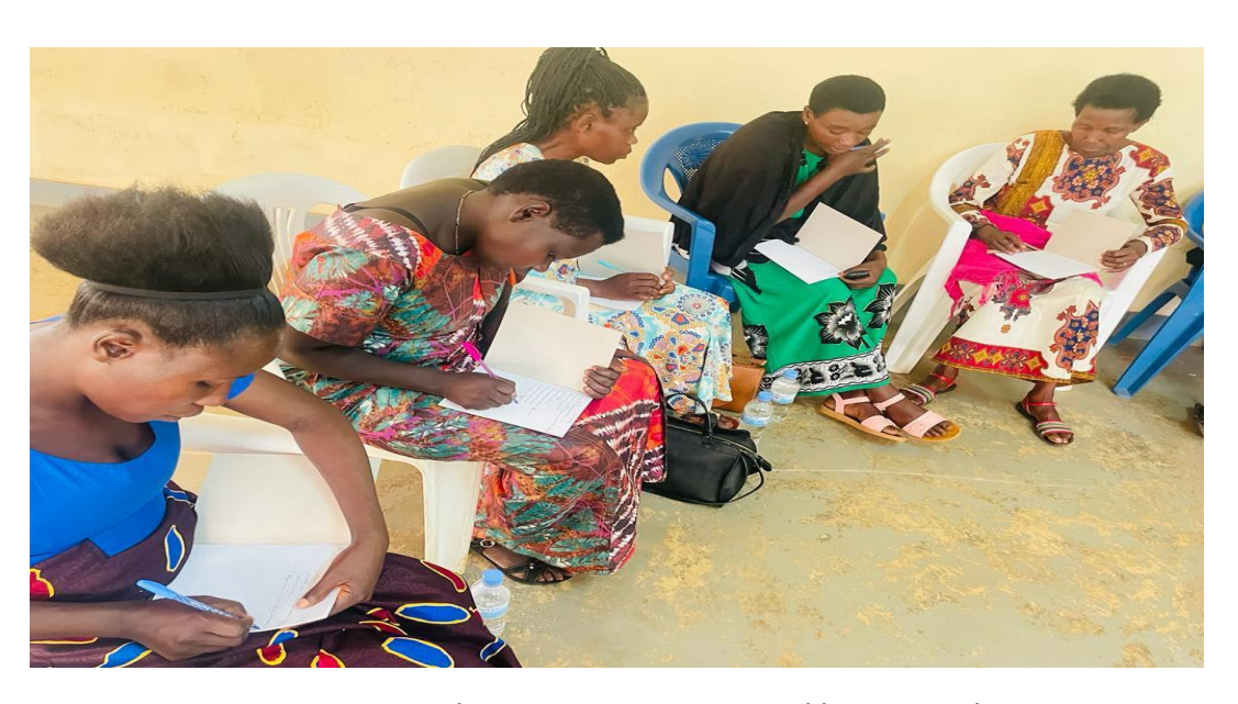
People receiving trainings and being taught

It is during the trainings the people voted for the leaders of their group. And decided to put in action what they have learnt starting from opening a saving account in SACCO. They also set Friday as a day they will always have meetings to discuss about their issues. After the trainings HHFR helped the beneficiaries to put themselves together forming one group with intention to work hard in the process of poverty alleviation, a body which should make their own decision according to what they need and the desired destination.