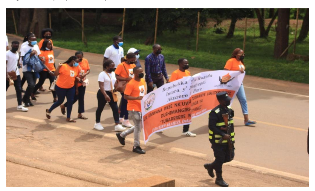
Walk to fight against rapid increase of street children

This is a program that HHFR started and it is in the main goals. Due to this program HHFR started to do many projects with intention to reduce the increase and the number of street children by giving them care, support, education and counselling them and their parents with aim to take them back home and give them proper life they deserve.