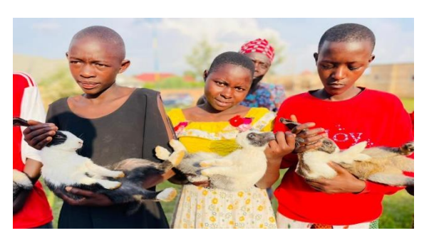
Children receiving domestic animals and hygiene materials.

It is in that case HHFR prepared an event of sharing some ideas with the parents of the children and the children themselves to find solutions of some problems they may face in the community. Same event took place on 22/02/2023. But this event was different because this time HHFR gave the children domestic animals which if taken good care of could help them in their daily life.