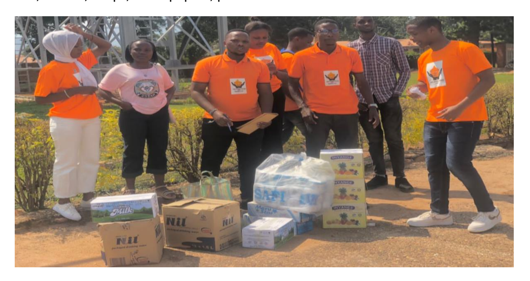
HHFR members arriving at the Hospital

On 30<sup>th</sup> September 2022, HHFR with the collaboration of CHUB gave help of foodstuffs and hygienic materials to patients in this hospital who are in need of those materials. Those materials were juices, milk, fruits, breads, soaps, toilet papers, pads . .